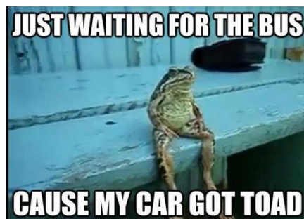
Figure 3 9 : Pun

depend a great deal on cultural knowledge or can sometimes be unintentional. An example of a phonological substitution would be “I keep reading “The Lord of the Rings” over and over, I guess it’s a force of hobbit.” 8 Here “hobbit” replaces the expected word in the collocation “force of habit”.