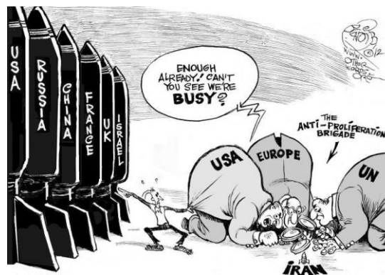
Figure 27: Situational irony in cartoons

When in the course of a torrential rain storm someone says “Nice day to go to the beach” it is more than evident that they really do not believe that it is an appropriate moment to go to the beach. The hearer may respond in kind (mode adoption) by saying “Yeah, good idea! Let me get my bathing suit” or they may decide not to enter into the humour frame and say “Stop being silly.”