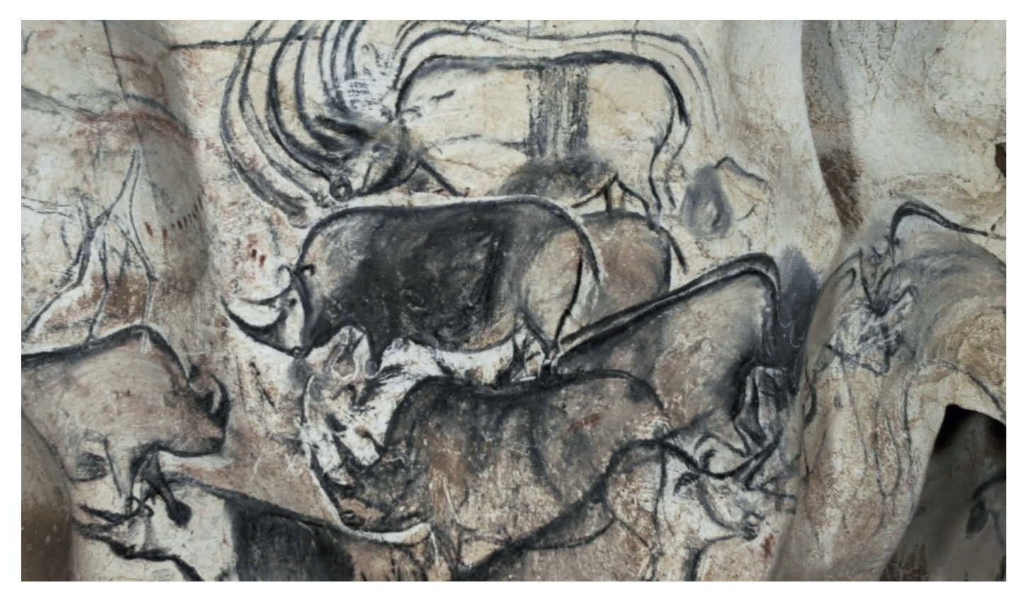
FIGURE 4: DETAIL OF LAYERED IMAGES OF RUNNING ANIMALS, VISUALIZING MOVEMENT BY OVERLAYING IMAGES IN «DIFFERENCE.»

Jennifer Barker's proposal for this type of analysis via a tactile engagement with moving-images– not just of the cave art, but also of the movie images themselves.<sup>28</sup>