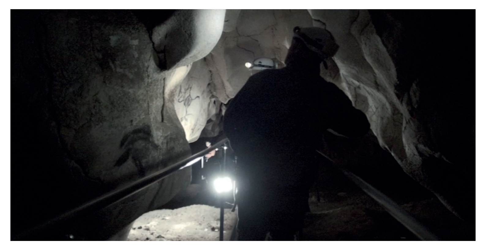
FIGURE 2: HIGHLY INTIMATE SHOT OF THE CAMERA THAT FOLLOWS THE EXPLORERS ON THE NARROW PATHWAYS, BRINGING THE CAMERA CLOSE, YET AT A CAREFUL DISTANCE, TO THE CONTOURS AND CURVES OF THE PAINTED ROCK SURFACE.

cinema l have pointed out how the aesthetic of the sublime in landscape depiction sets up a dual ambition of submission in awe and wonder, and a resulting desire for visual mastery.<sup>21</sup> This ambivalence results in tensions so effectively organized in, for example, high-paced, 3D action movies, very similar in effect to the so-called phantom rides of early cinema. These are point-of-view shots of passing landscape taken from a moving vehicle such as a train or car. As such, they boast about the technological possibilities of travel and the moving image together. What the use of 3D technology as exploratory rather than immersive counters is this rather long tradition of visual challenge and its overcoming through domination –called the sublime.<sup>22</sup>