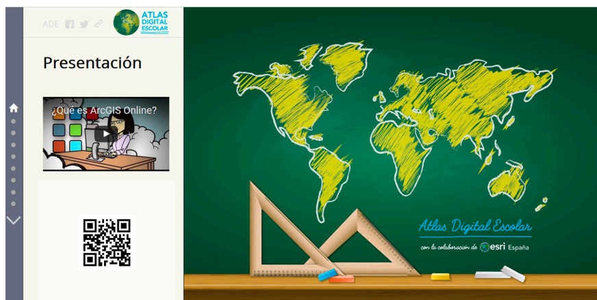
Figure 3. Digital Atlas for Schools front page.

The Digital Atlas for Schools (in Spanish, Atlas Digital Escolar , ADE) (accessible at atlasdigitalescolar.es ) (Figure 3) is a set of maps drawn from the previous WebGIS experiences of the mixed team, composed by geography educators at colleges and teachers of geography at K–12 levels.