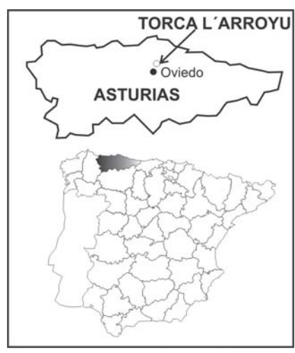
Fig. 1.- Geographical location of Torca l'Arroyu.

of the Tertiary of the Basin of Oviedo; then, the river gets into the Carboniferous limestones of the Naranco hill, more towards the W. The cave is located in the slope of the right side of the Nora river,