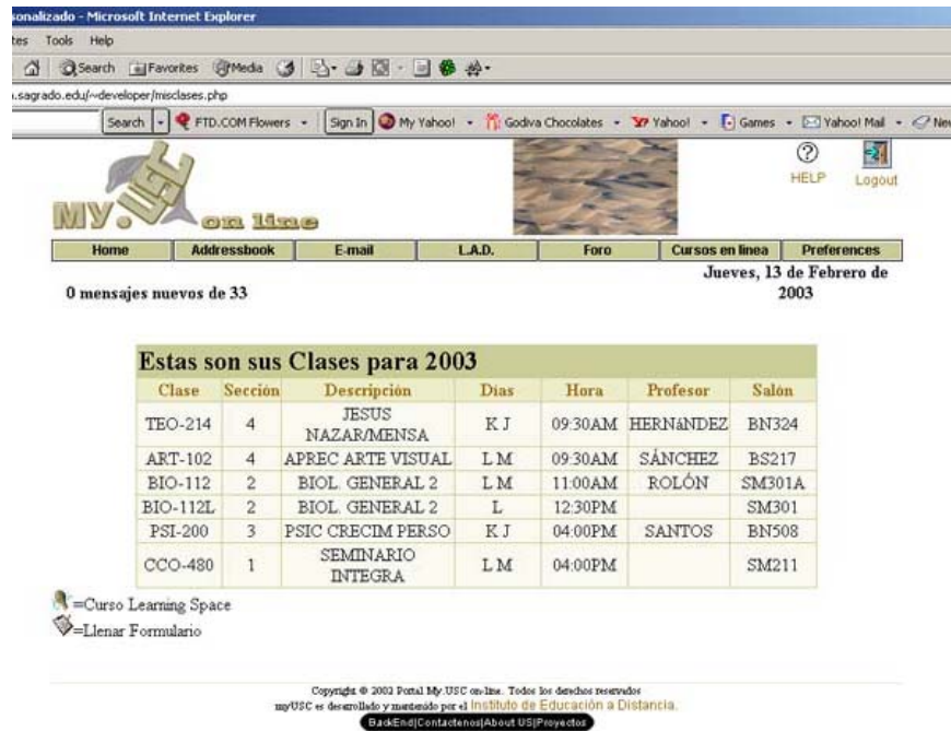
Figure 1: MiSagrado Personalized Portal

A personalized portal for students and faculty has been implemented, that helps to create a sense of community and provides personal course information to the community. The MiSagrado Portal gives students a unified access point to course and academic information, and allows him/her to participate in various activities.