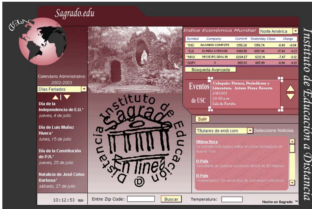
Figure 4: Sagrado Screensaver

Finally, as a last example of community-enhancing tool, we built an information-rich screensaver. The Sagrado Screensaver was designed so to enlarge our “Web-centered” community to include every person with a computer. Through the screensaver, people get up-to-date information on USC’s calendar of events and activities, news from local and international sources 1 , and also a glimpse at the world’s economic situation. The screensaver has just been released, and we are currently in the process of distributing it.