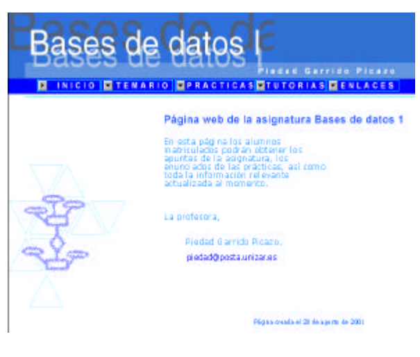
FIGURE. 1 HomePage Example

Alternatively and depending to the in-depth level of the pages, it has been added different kinds of heading pages with its respective navigation elements: links to the previous page, to the following page, and sometimes to the home page if it has seen fit to do it.