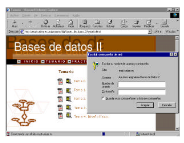
FIGURE. 4 An Example of a subject Authentication

login and a password. It is a simple and quick solution, in case you have not a Extranet/Intranet Platform inside your institution. A normal situation at Spanish Universities, when talking about to introduce distance learning at public teaching.